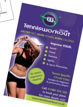
Class Promotional flyers