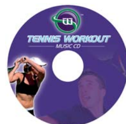
Music CD timed for easy class control