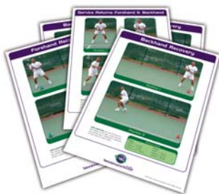
20 full colour laminated circuit station cards