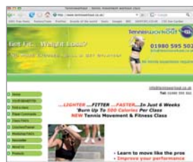
Website Promoting Classes with YOUR FREE LISTING